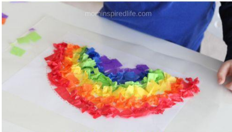
Tissue Paper Rainbow Suncatcher